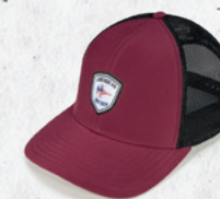
Wine / Black