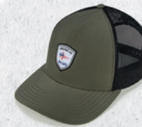
Rifle / Black