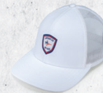
Snow / White