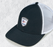
Midnight / White