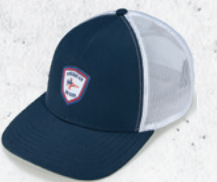
Resolution / White