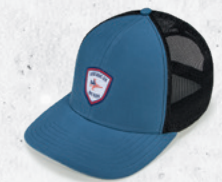
Admiral / Black